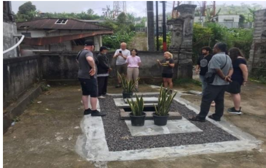
Figure 1. Sustainable water conservation by building rainwater recharge wells.

Efforts to increase public knowledge regarding groundwater conservation were carried out with technical guidance on groundwater conservation for one day. The results of understanding before and after