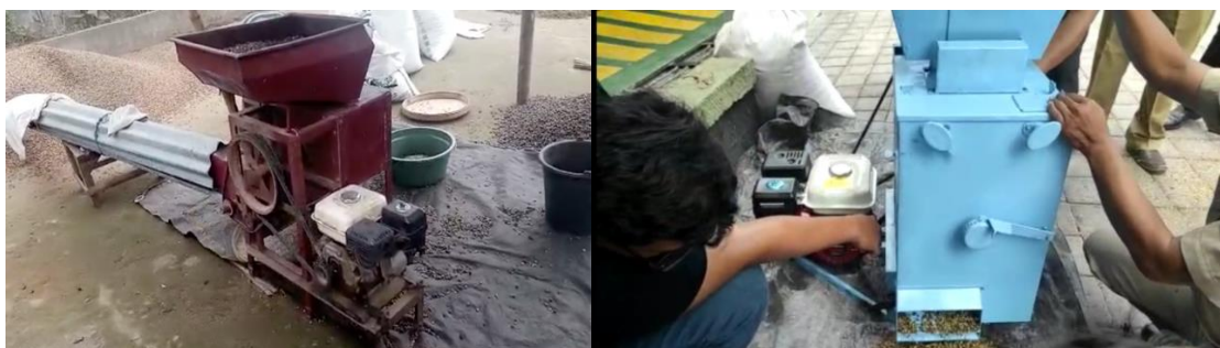
A. Old Model Machine

The comparison between the use of old model peeling machines and new model peeling machines is as follows: